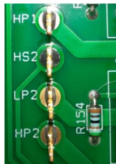
Wetting: Product b