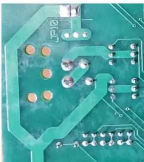
Residues: Product a

The Balver Zinn Group introduces REGI-007 VOC an alcohol based flux with an organic activation system. REGI-007 VOC is a high reliable No-Clean flux for various soldering applications classified as ORL0 according to IPC J-STD-004 standards. This brand-new flux offers superior wetting performance with clear, dry and almost un-visible residues.