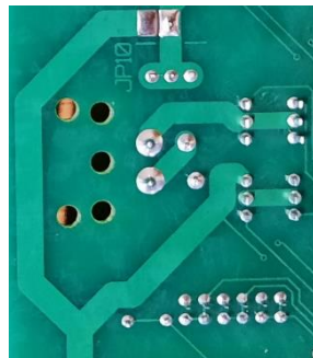
Residues: REGI-007 VOC